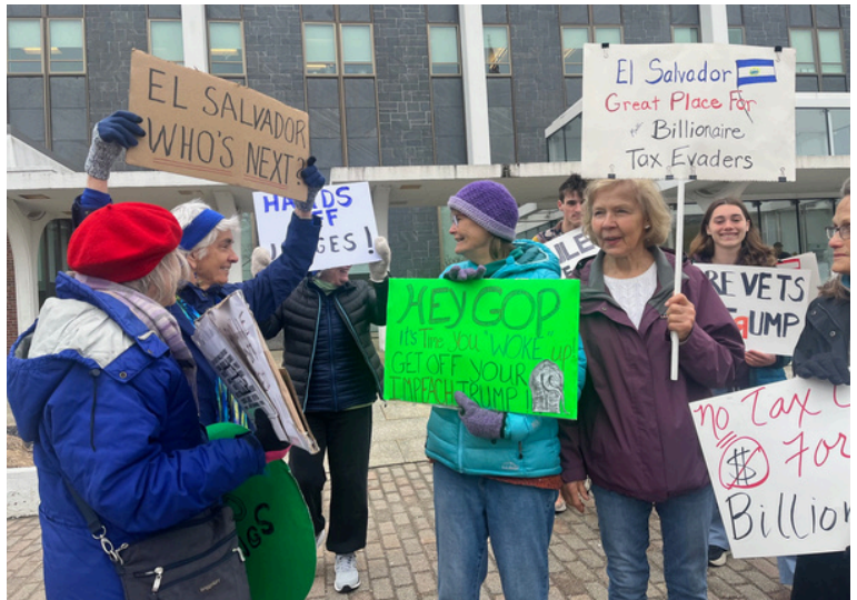
Right: UUSB at the weekly Tuesday protests outside the Bangor Federal Building.