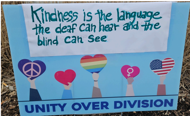
Above: Lawn sign at the rally on Tuesday, April 15.