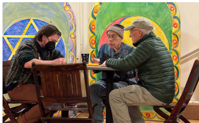
Above: No Kings Rally, February 17, 2025 Bangor, ME. Right: UUSB Game Night on February 1, 2025.