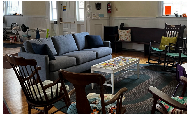
Above: Right: The Guild donated a new couch for the Dorothy Memorial Hall.

This month, we have our Winter Solstice ritual on the 22nd and Christmas Eve service on the 24th. With all the holidays and the very short winter days, being present is a necessity.