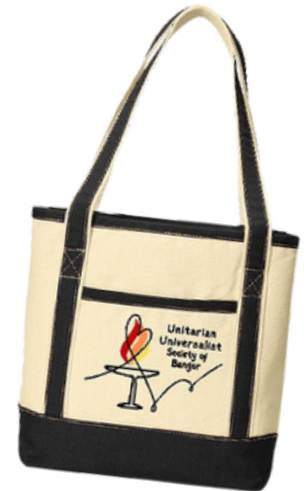
bags & totes