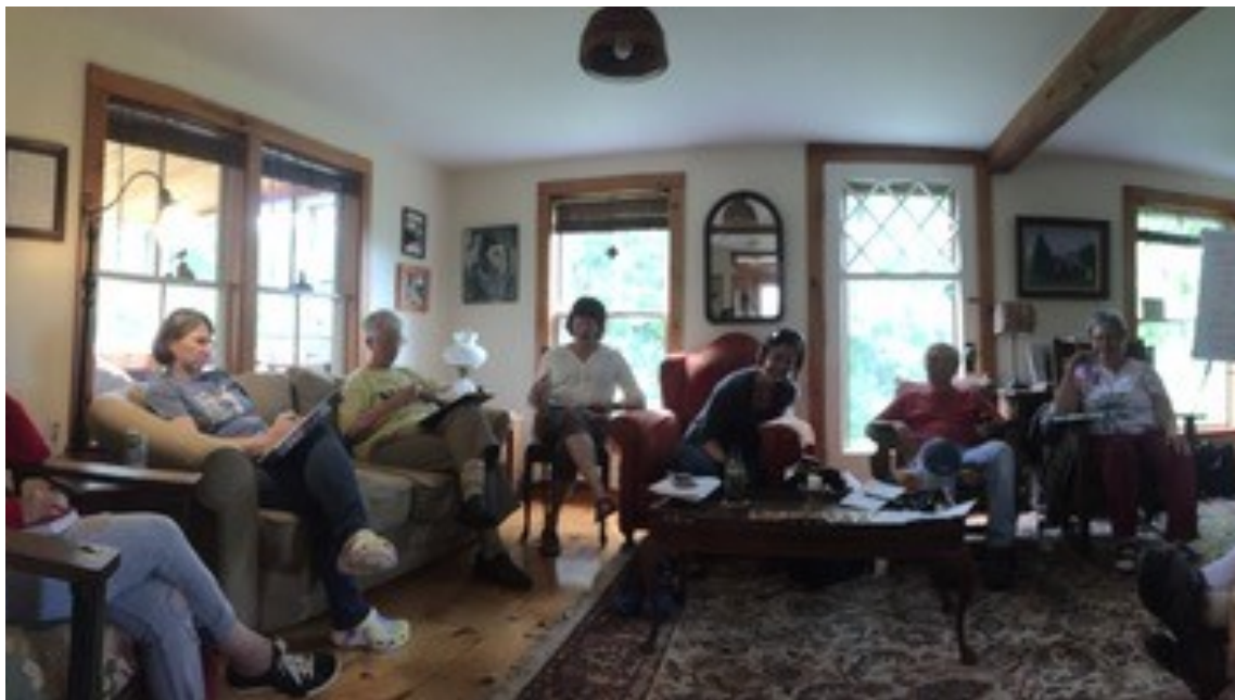
"UUSB Council Meets with Committee Chairs at the Leadership retreat at Pumpkin Hill Farm in August."