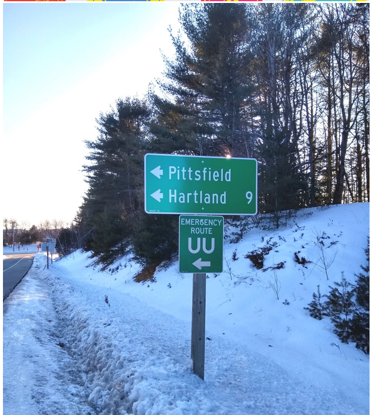
"When turmoil abounds, take the emergency route to UU."